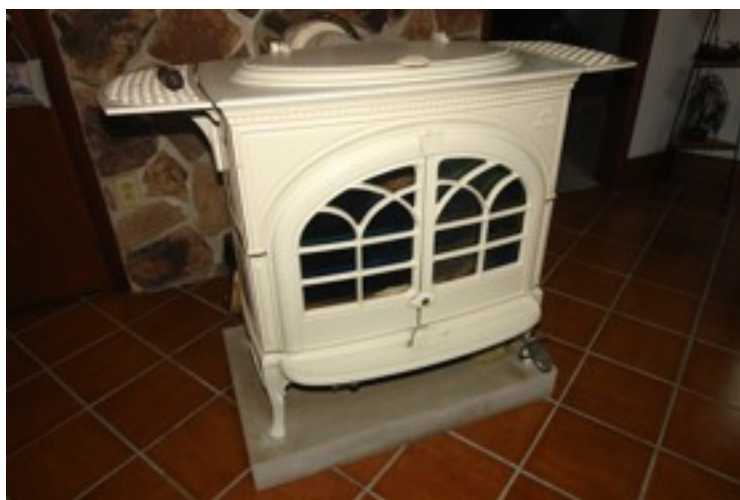
Figure 5. Jotul Firelight Model #12 Wood Stove

Also one must store sufficient fuel (kerosene, dry seasoned firewood, wood pellets or corn) to last during a prolonged electrical power outage. It might be reasonable to store firewood away from the house to minimize the threat from termites.