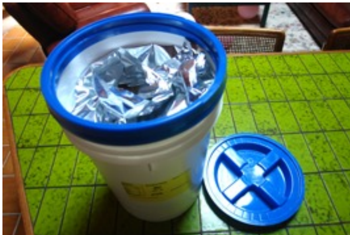
Figure 1. 6-Gallon Superpail, Gamma Lid Removed

and other vermin out. An example of this type of storage is shown in Figure 1 . It is important to keep food in these Superpails stored at as cool and steady a temperature as possible (below 75 degrees but not freezing). Food in this form stored in a cool environment will last 20+ years. Thus you can avoid the problem of constant food rotation. The Superpails are stackable and fit easily inside a closet. I found the cost of this food a little higher than the cost at a grocery store. I recommend rice, beans, peas and lentils because of their ease in preparation (simply cooked in boiling water). Wheat, spelt, barley and oats will generally need to be ground to make flour which will then be processed into bread, pasta, cereals, etc. A grain grinder will be required to process this type of grain into flour. I have bought and used this product and give it my thumbs up.