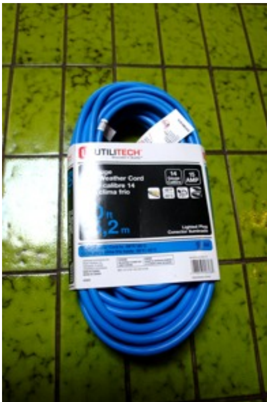
Figure 18. Arctic Blue Cold Weather Cordset

At temperatures colder than 0°F (-18°C), many people also leave their vehicle running overnight. Leaving your car idling uses about four or five gallons of gas, but you don't have to worry about the car starting and it also prevents the interior plastic and vinyl from cracking if it gets bumped accidentally before it has a chance to warm up.