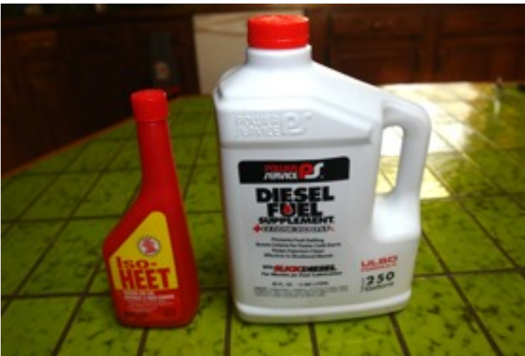
Figure 16. Fuel Antifreeze

Water condensation forms on the inside of the gasoline tank. In cold temperatures, this condensation can freeze and plug the fuel line. Without fuel the engine dies and cannot be restarted. Two methods are commonly used to prevent this problem. First, keep the fuel tank full. This will minimize the area available for condensation to form. Second, add a gas line antifreeze, such as HEET, to the gasoline tank with every fill-up. For diesel engines, an additive such as PS Diesel Fuel Supplement can be used as an anti-icing additive and the supplement also prevents fuel gelling down to -40^{\circ}\text{F} ( -40^{\circ}\text{C} ). See Figure 16 .