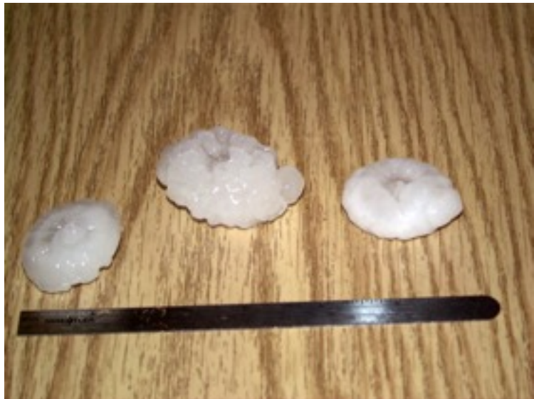
Figure 21. 2-Inch Diameter Hailstones

One day at work a hailstorm hit. This hailstorm was unusual because of the size of the hailstones. Some were 2 inches in diameter or larger. They looked like squashed doughnuts in shape. Taking my life in my hands, I went out into the hailstorm and gathered up a few samples. Then I quickly took them inside and photographed them before they melted. Figure 21 is one of the photographs. These hailstones were of a size that could damage automobiles. In this case they destroyed the side mirrors, windshield and produced many dents on the hood/trunk and tops of vehicles. Individuals at work started calling their insurance companies to report the damage. The response they got from their agents were lackluster. I had sent the hailstone photographs to individuals within my department by email. But they forwarded it to others