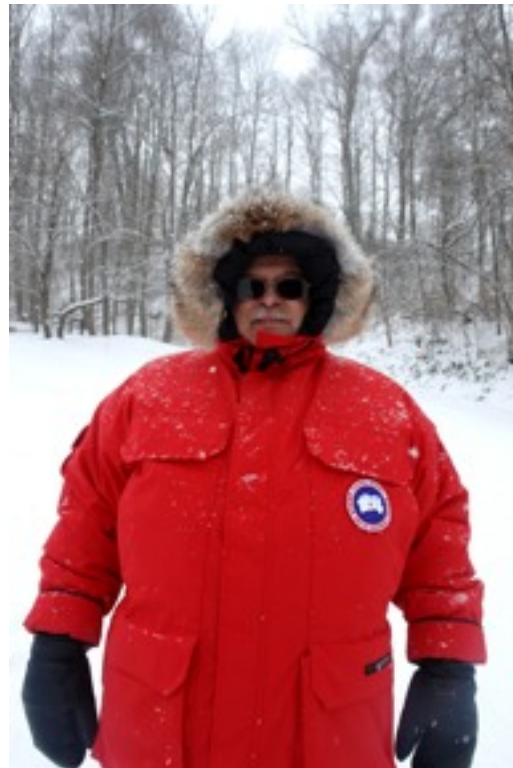
Figure 12. The Polar Expedition Parka

Military "Mickey Mouse" boots will keep your feet warm in extreme cold weather. They can be purchased used, reasonably priced at an Army Surplus store. Black Type I Extreme Cold Weather "Bunny" Boots are designed to be worn in wet or dry conditions down to -20^{\circ}\text{F} ( -29^{\circ}\text{C} ). White Type II Extreme Cold Weather Boots are suitable cold dry weather in snow or ice conditions down to -60^{\circ}\text{F} ( -51^{\circ}\text{C} ). These boots were first used by the military during the Korean War. Their most distinguishable features are their giant size. Reminded of the iconic cartoon character, soldiers joked they were in Mickey Mouse's shoes. The black boots are 100% rubber,