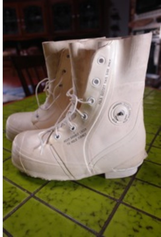
Figure 13. Mickey Mouse White Type II Extreme Cold Weather Boots

with thick wool insulation all around, plus an insulating air pocket all sandwiched between the layers of rubber. The white boots are constructed with insulation consisting of three layers of needle punched polyester foam hermetically sealed within an outer and inner layer of rubber. The boot is provided with a pressure release valve to adjust internal air pressure in the boot during high altitude operations. Refer to Figure 13 .