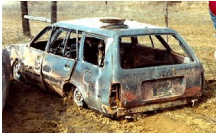
Figure 19. Burnt Out Shell of a Car

Some try a different strategy. They cover their cars' hoods with blankets to hold in the heat and then fire up an electric-heated blowers or propane heaters to warm the engine. But alas the engine compartment gets so hot, it blisters the paint on the hood of the car.