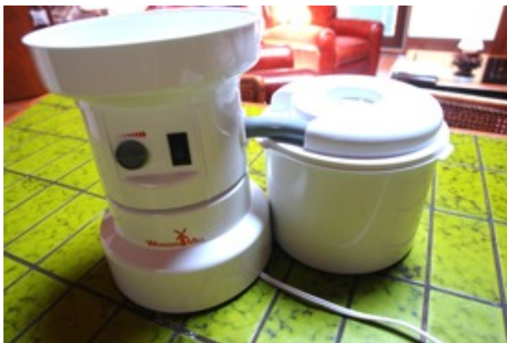
Figure 3. Wonder Mill

Wonder Mill is an electric grain grinder. The mill can grind around 10 cups of wheat into flour in about a minute. This is enough flour to make a couple loaves of bread. Refer to Figure 3 .