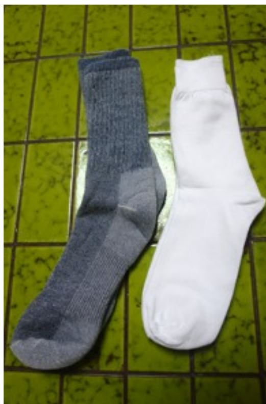
Figure 10. Stockings Right--Thermolite Inner Wick Dry Stocking Liners Left --Outer Outdoor Merino Wool Trail Socks