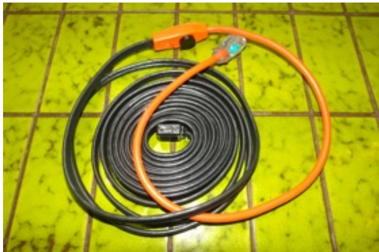
Figure 6. Electric Water Pipe Freeze Protection Cable

Water pipes that are susceptible to freezing (such as exterior runs) should be wrapped with electric water pipe freeze protection cable and then wrapped with insulation. Refer to Figure 6 . This should keep the water flowing down to -40^{\circ}\text{F} ( -40^{\circ}\text{C} ). But if you lose electricity for several hours during extreme cold, this protective will fail.