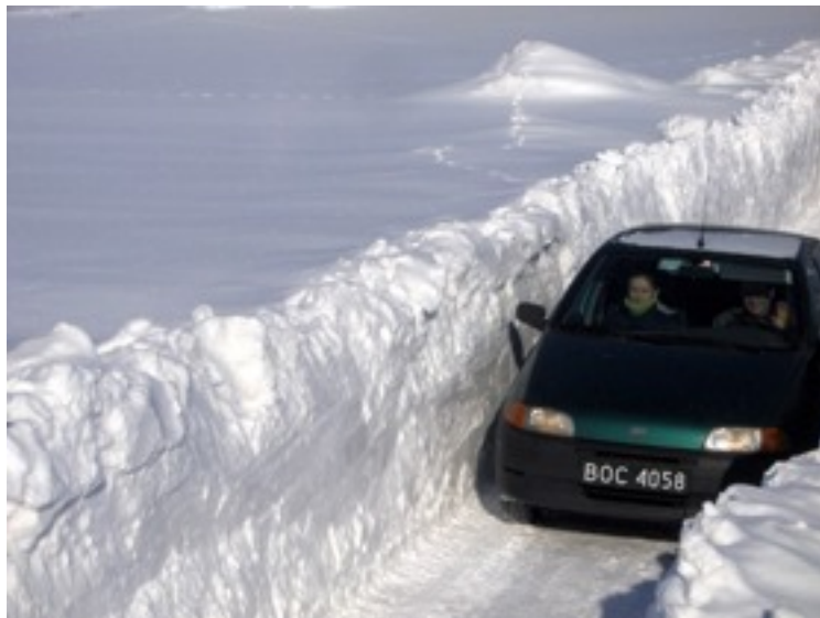
Figure 20. Greater Snow Accumulation

Cars can get so badly flooded from continuing to pump on the accelerator during cold mornings, that the engine may finally explode. Sometimes this blows the dipstick out of its socket and dents the hood of the car. Other times it causes the mufflers to blow off the cars when they finally start.